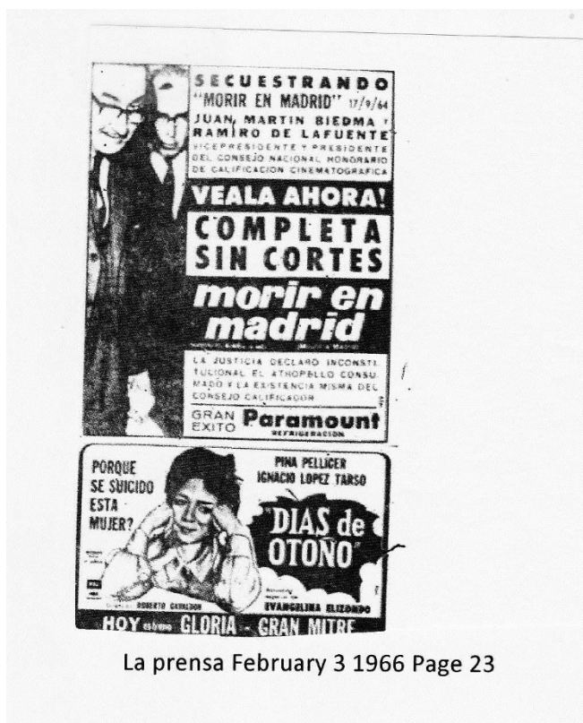
La prensa February 3 1966 Page 23