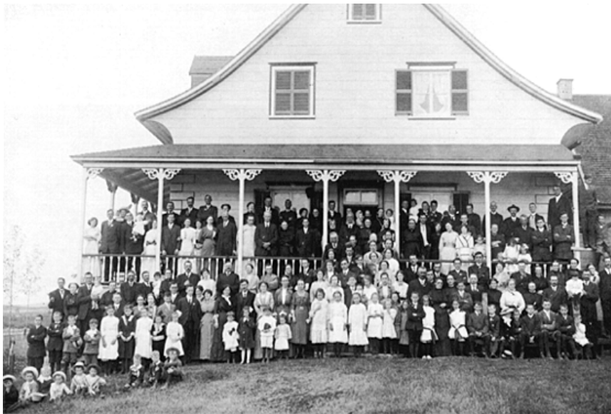
Beauceron family gathering, circa 1900

“Elle,” as she is referred to “Le Peuplement de la Terre” is a descendent in a long line of women whose primary function was to populate the province. Up until the Quiet Revolution, Quebec had one of the highest birthrates in the industrialized world. Beginning in the 16 th century and throughout the colonial period, cultural survival was predicated on population growth. Once the French finally got down to the business of colonizing New France – after a good century of adventuresome men trolling the continent for furs and elusive gold and mineral deposits – childbearing at last became a priority. Religious orders set up shop in part to convert native women into good Christian wives. When that tactic didn’t bear enough fruit, perspective brides, euphemistically called, “les filles du roi” were imported from France in the 17 th century. Eventually, efforts were so successful that during the French regime, “giving birth