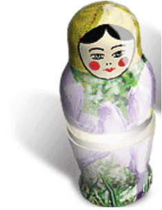
From the Cercles des Fermières' website.

of food to be given to the baby, mathematical charts showing how much baby formula to administer to a child who can not be breast-fed, wake-up schedules to help cure bed-wetting. Here is an excerpt from those instructions: