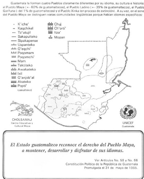
FIGURE 4: Cholsamaj map of Guatemala with UNICEF symbol